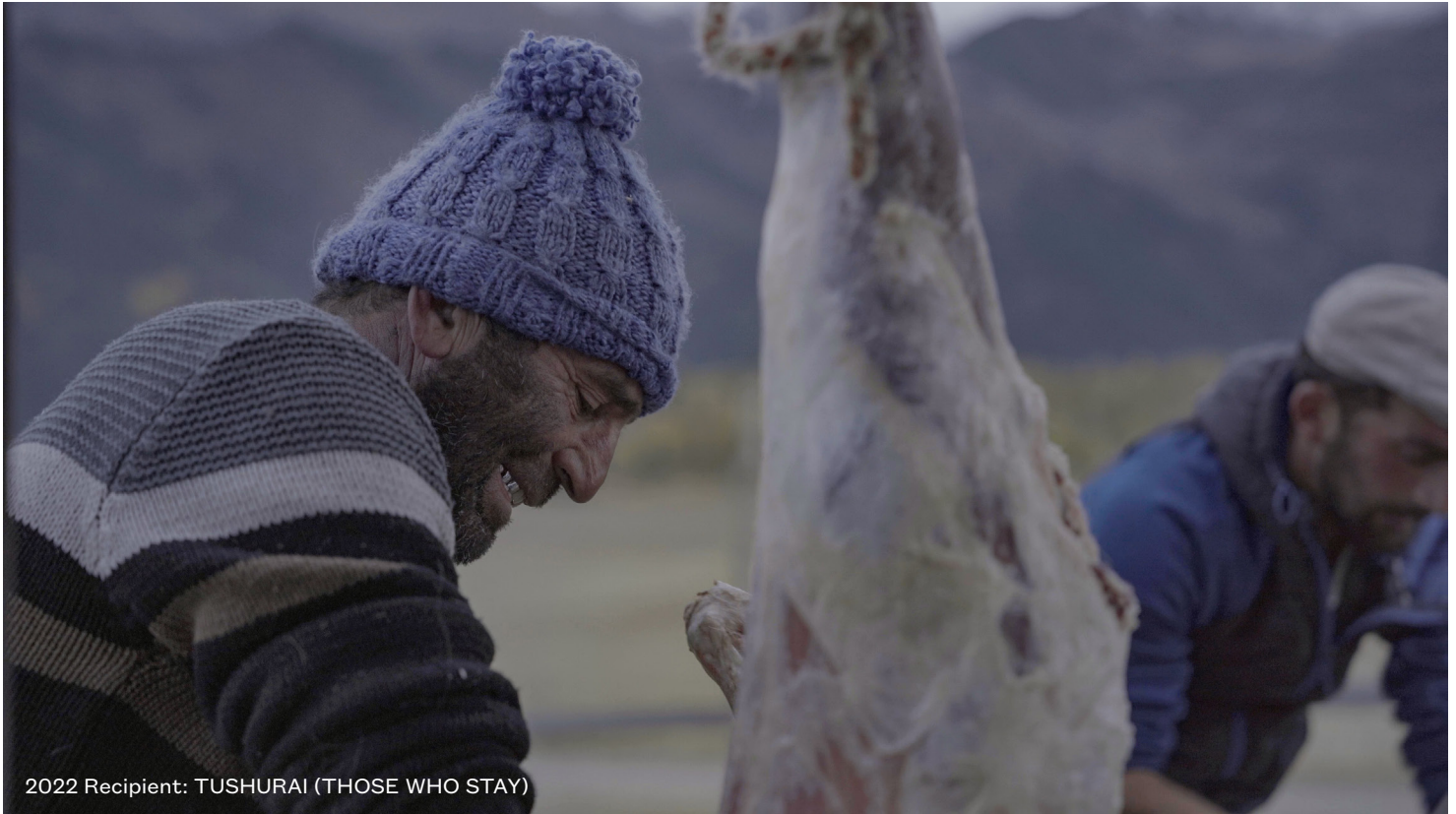
2022 Recipient: TUSHURAI (THOSE WHO STAY)