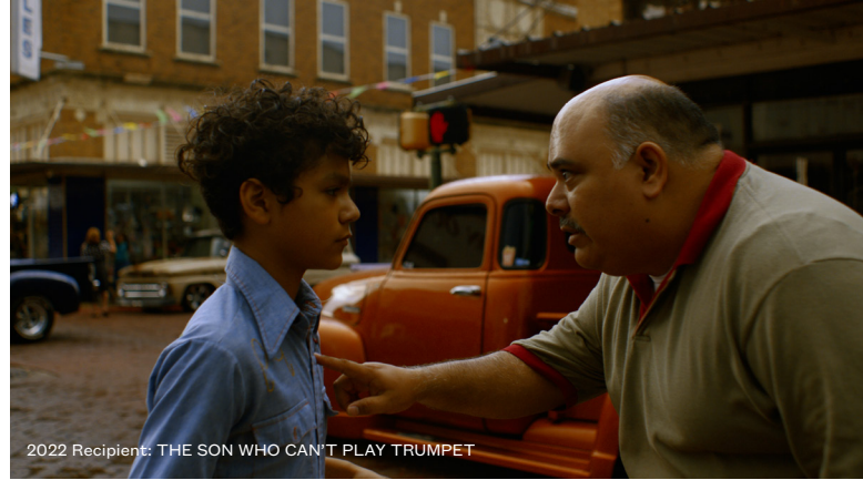
2022 Recipient: THE SON WHO CAN'T PLAY TRUMPET