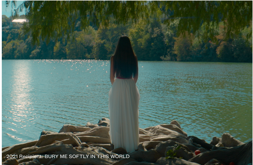
2021 Recipient: BURY ME SOFTLY IN THIS WORLD